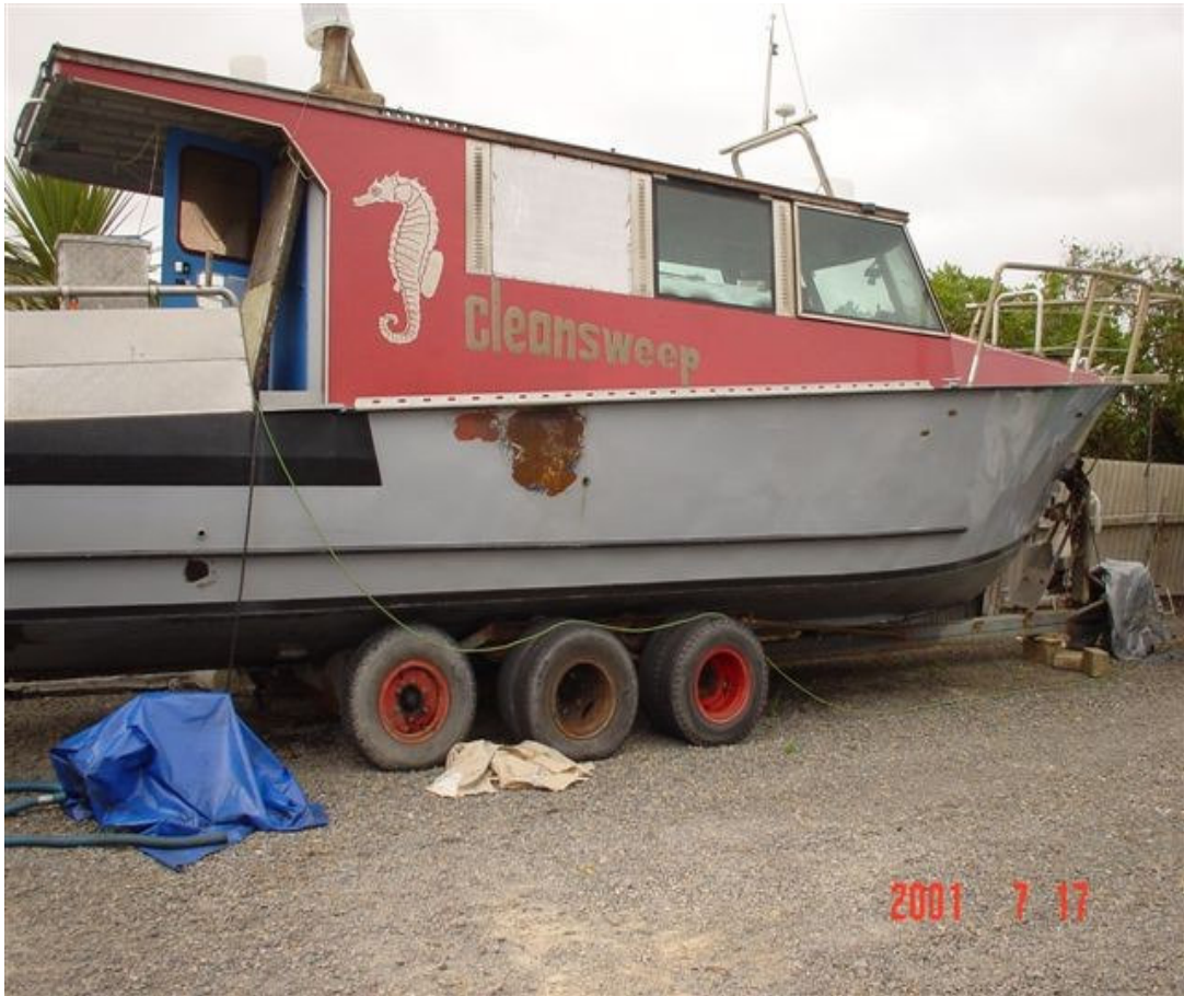
Figure 1 Cleansweep