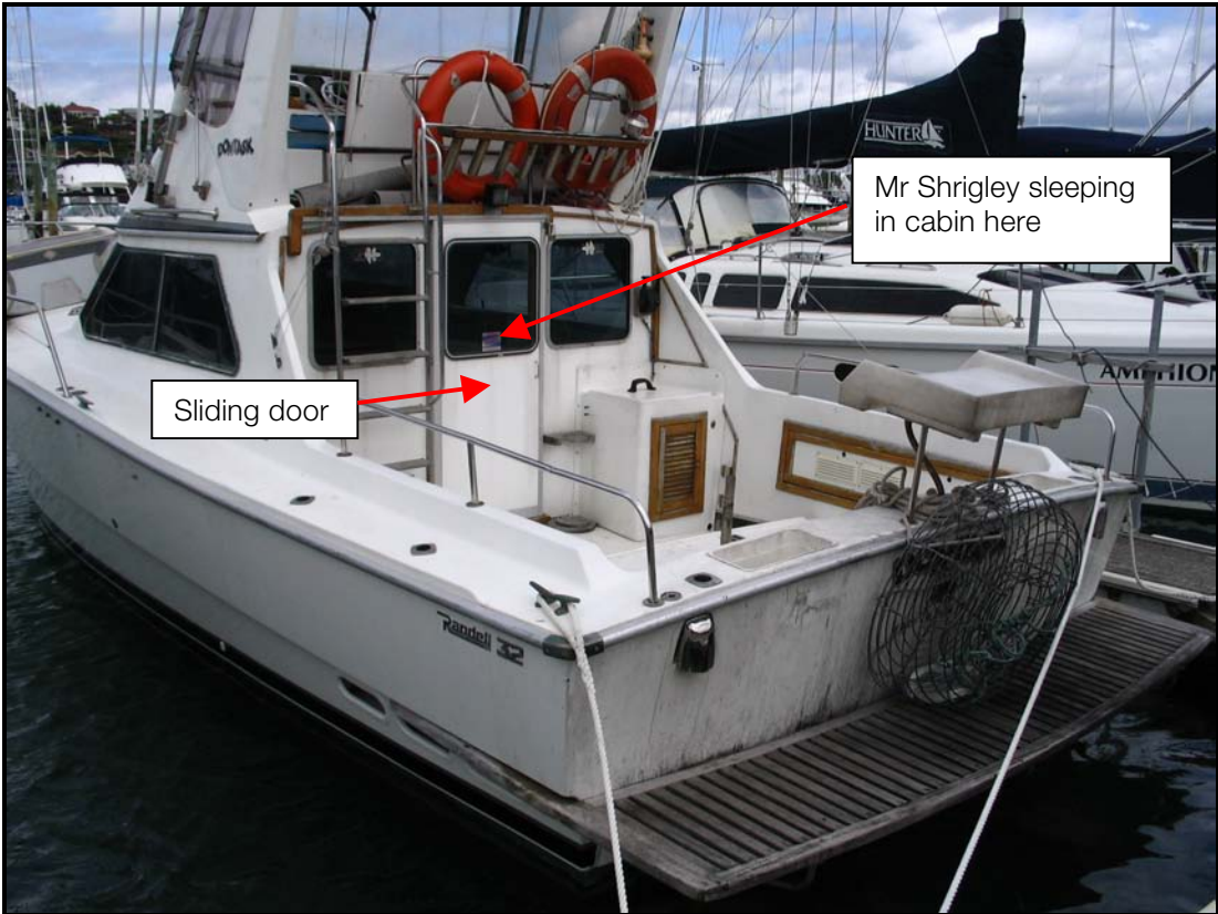
Photograph 1 Don't Ask

At 0532 hours the vessel Valium located a body close into shore in position 36° 25.615' S 174° 50.112'E in approximately one metre of water. The body was recovered at 0534 hours by the Coastguard vessel North Harbour Rescue #1 and was subsequently identified as being Mr Shrigley.