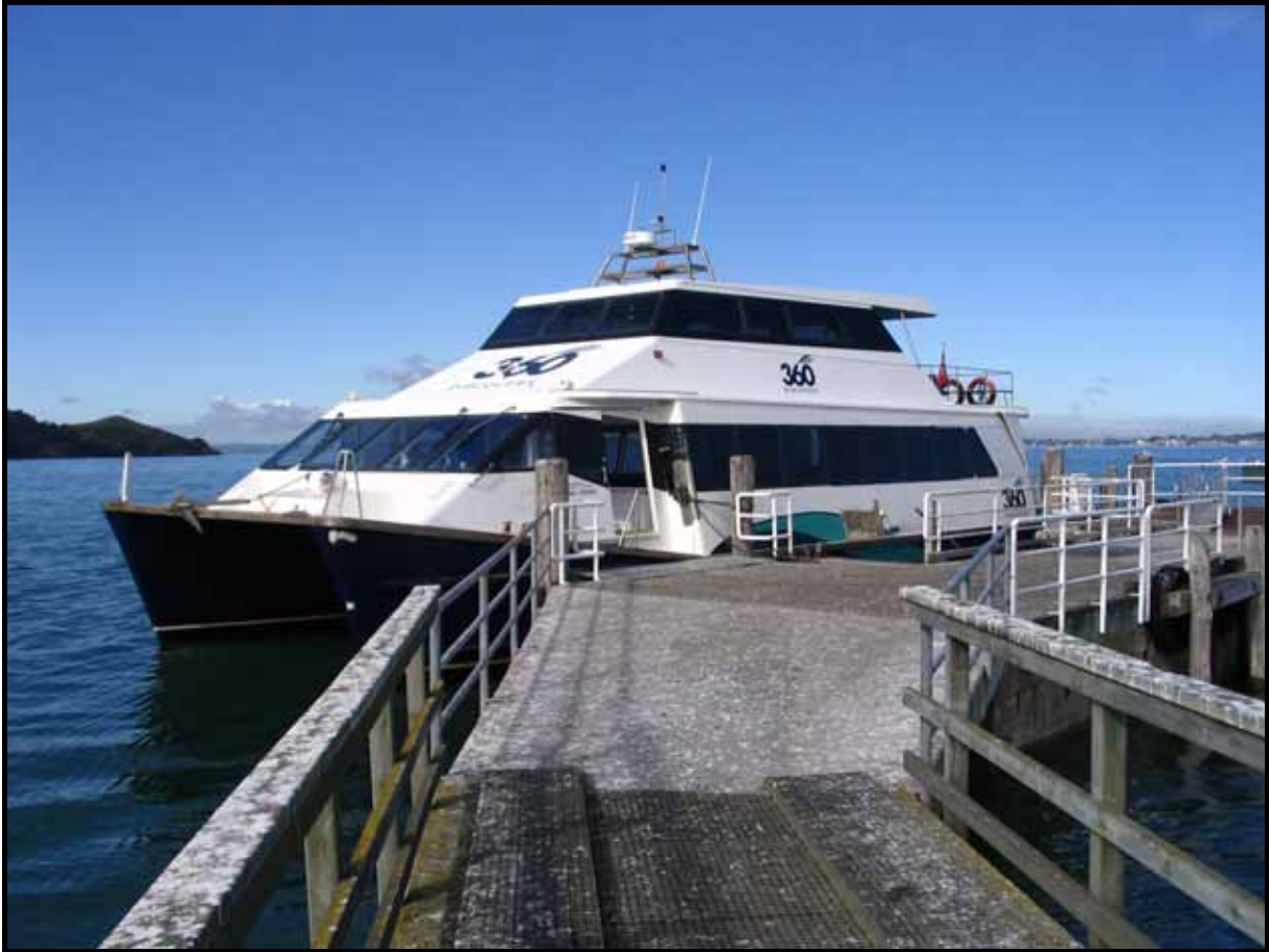
Photograph 1 Kawau Kat alongside Motuihe Wharf at high tide.