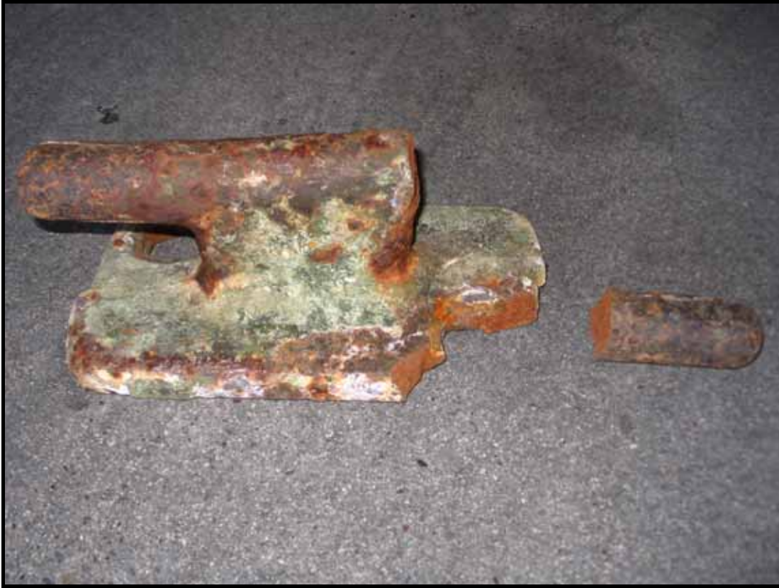
Photo 4 Mooring Cleat and Detached 'Horn'