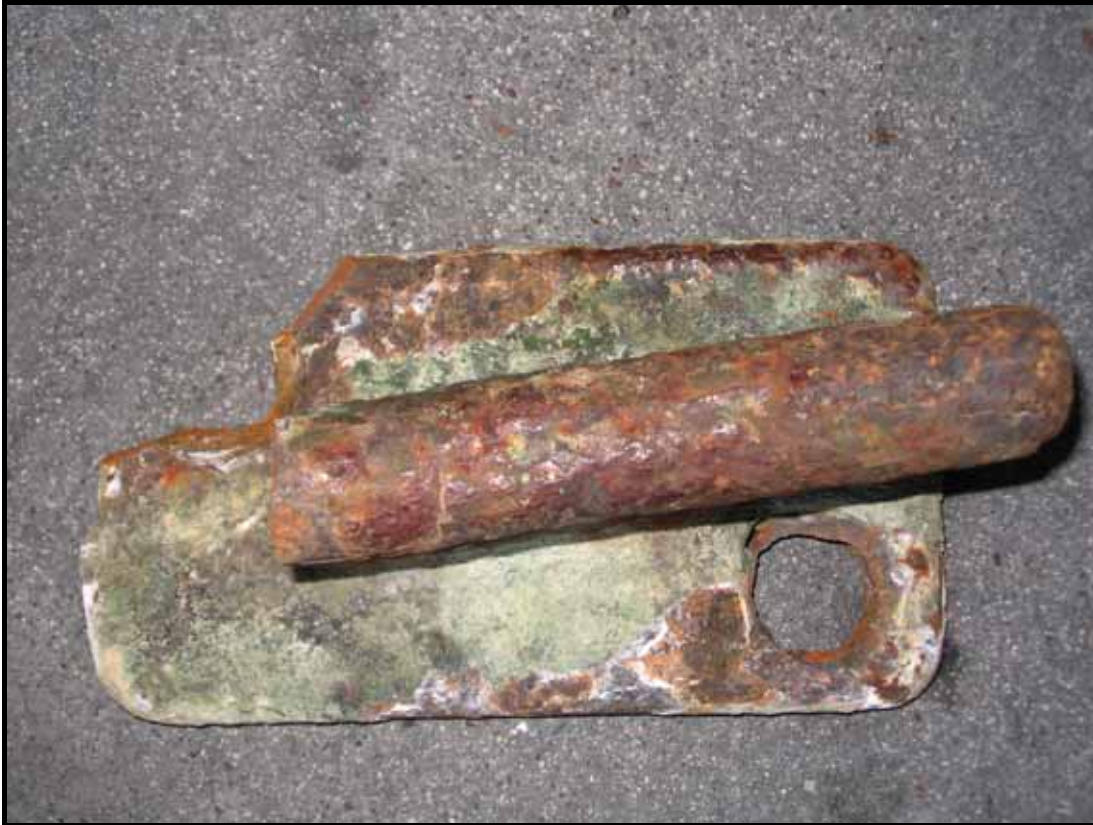
Photograph 6 Mooring Cleat Showing Corrosion Around Bolt Hole