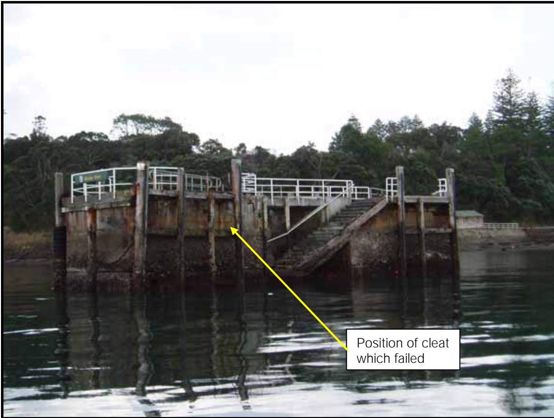
Photograph 3 Motuihe Wharf