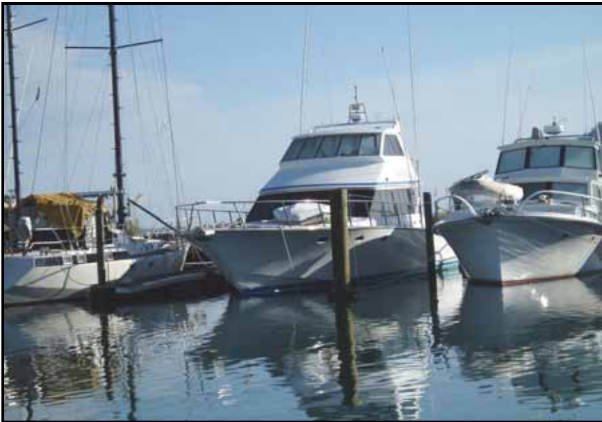
Photograph 2 Ocean Monarch

The Skipper of Ocean Monarch disputes the above account of events and states that his vessel was travelling at 16 knots on a course of 170 M (190°T) to Tauranga when he saw Manutere on his port bow. As the two vessels drew nearer he estimated that Manutere was making about nine knots and heading approximately 260°M (290°T). In his estimation, the two vessels were crossing and Ocean Monarch was on Manutere's starboard side. Hence, under Maritime Rule 22.15 , Manutere was the give way vessel.