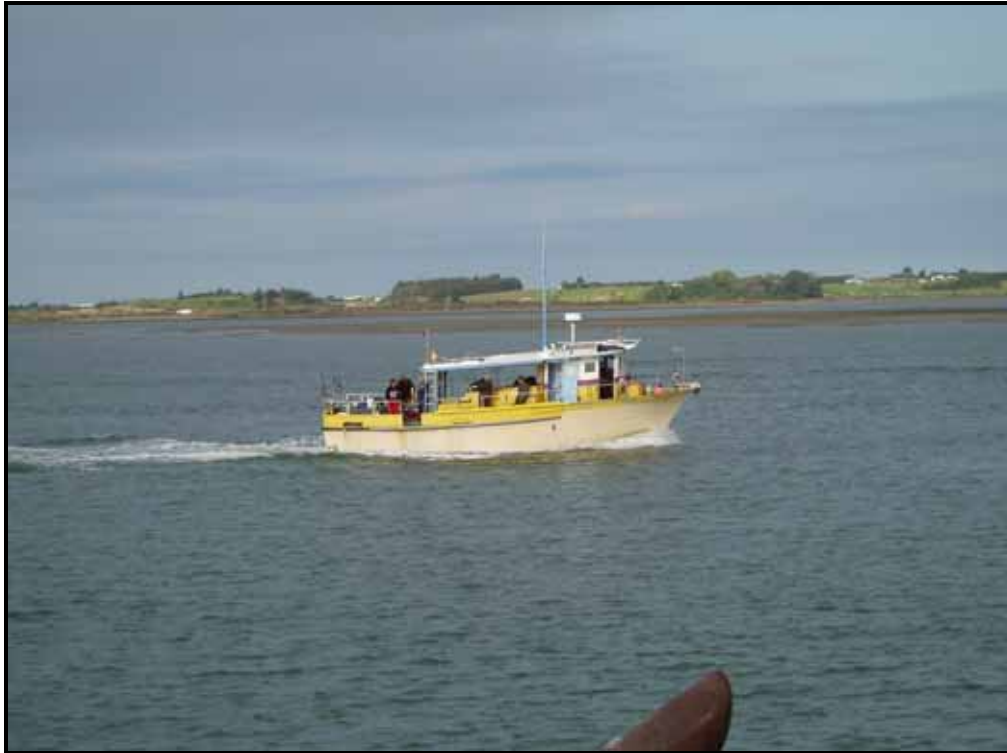
Photograph 1 Manutere

On Saturday 11 March 2006, at about 1800 hours New Zealand Daylight Time (NZDT), Manutere left Tauranga harbour. On board was the Skipper, one Deckhand and eight passengers. They headed for Mayor Island and the passengers were on the after deck, fishing during the passage. At about 2300 hours, Manutere entered Southeast Bay, Mayor Island and anchored for the night.