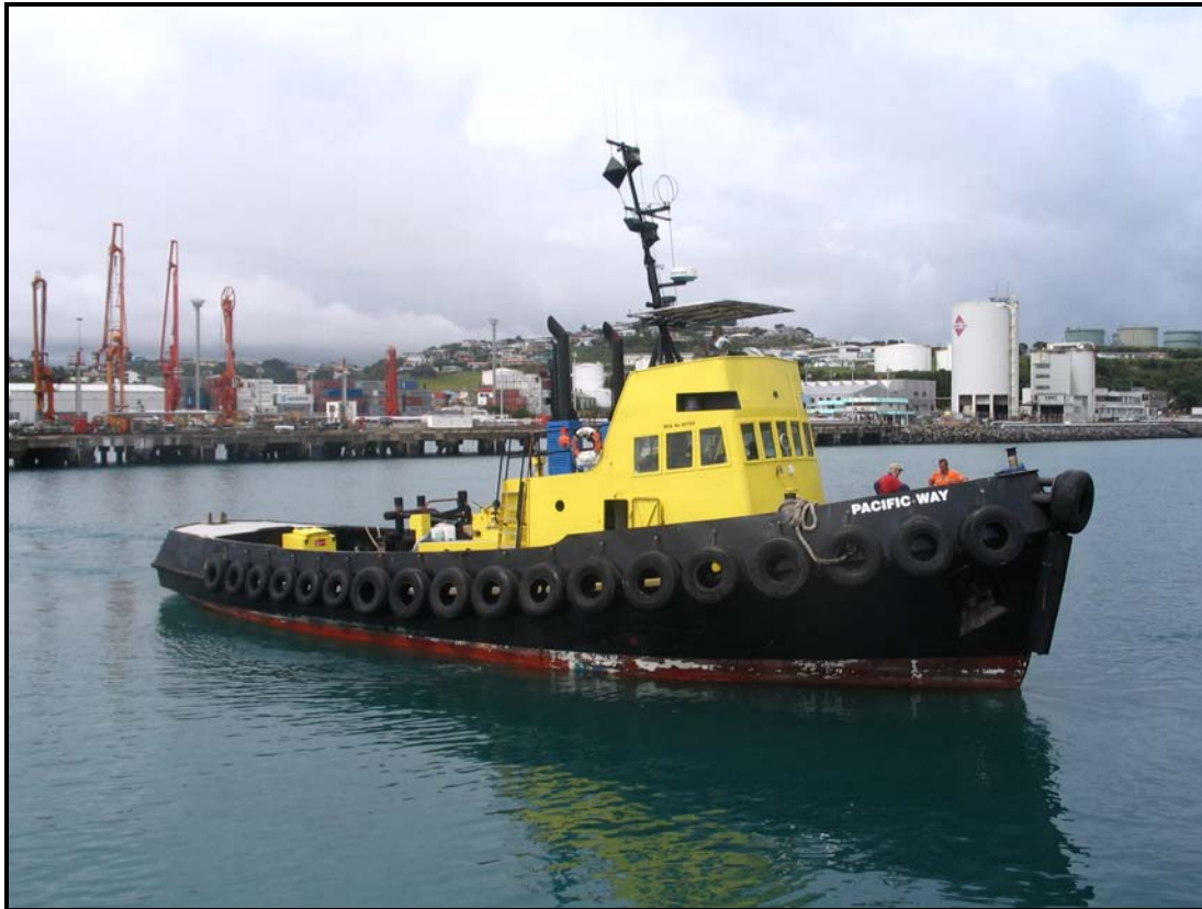
Photograph 1 Pacific Way

A crewmember suffered an injury to his wrist when the handle connected to the manually powered windlass that he was using counter-rotated due to a heavy weight coming onto the anchor cable in the prevailing swell conditions.