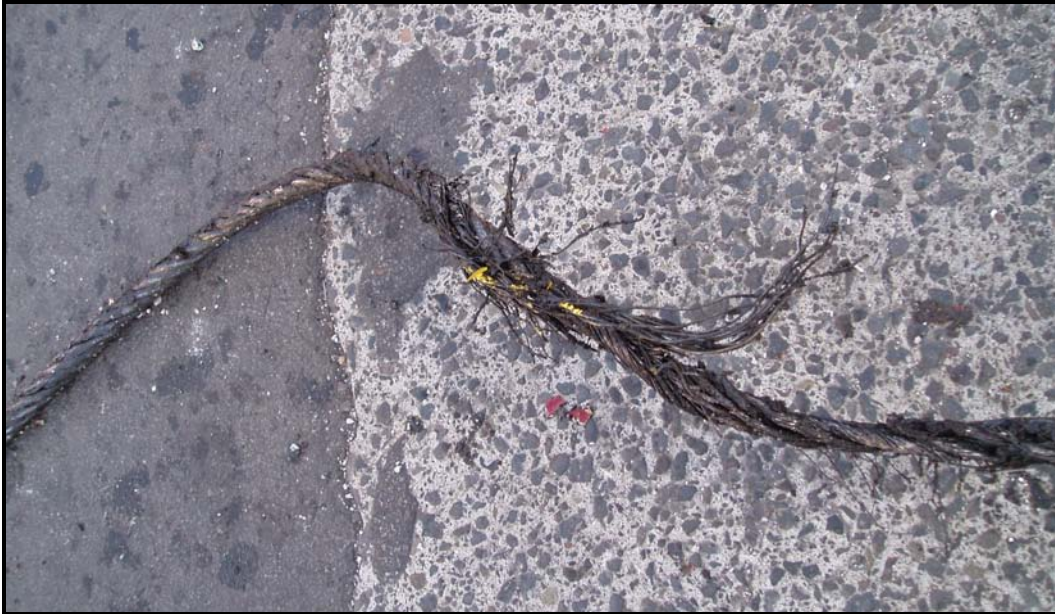
Photograph 5 The broken topping lift wire from the No. 2 crane