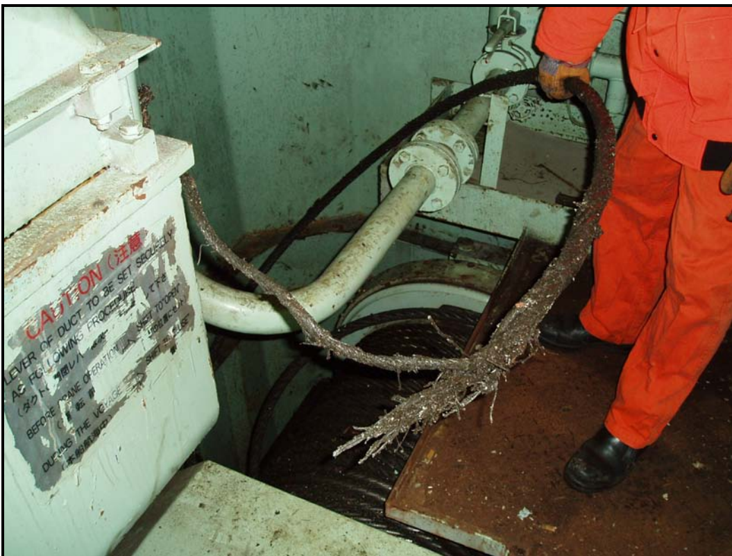
Photograph 6 Inside the No. 2 crane, showing the broken topping lift wire.