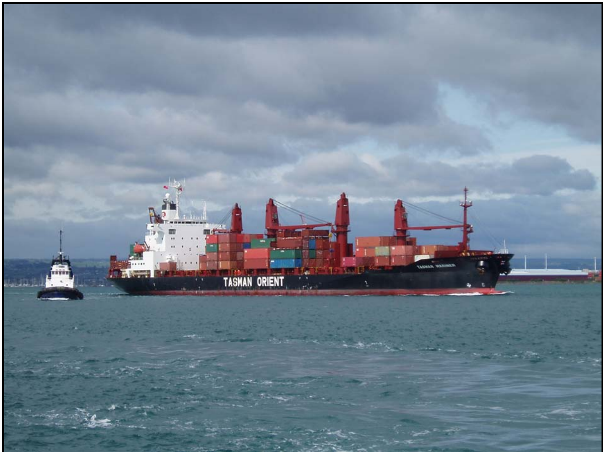
Photograph 1 Tasman Mariner departing Tauranga

On 20 September 2005, Tasman Mariner was moored port side to No. 6 berth, Mount Maunganui wharf, working cargo at No. 3 and 5 holds. At 0309 hours, New Zealand Standard Time (NZST), after loading packaged timber into No. 3 hold, No. 2 crane was being positioned over cargo on the wharf, when the topping lift wire rope parted, allowing the jib to fall onto the wharf. The crane was carrying no load at the time. There were no injuries but the crane jib, cargo block and hoist wire were severely damaged.