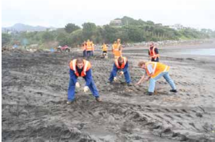
Beach pre-cleaning during the Taranaki exercise

Staff from the Taranaki Regional Council, National Oiled Wildlife Response Team and other organisations were involved in planning and operational response during the one-day exercise.