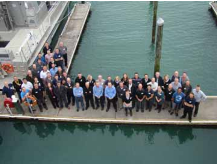
The NRT in Auckland in May