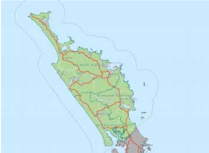
Map of Northland region

Northland has 3200 kilometres of coastline, including 15 harbours.