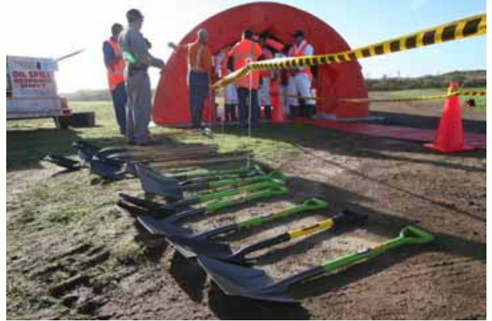
The decontamination tent set up during the Bream Bay exercise

He says there have been a number of recent overseas events where oil has affected shorelines similar to that of Bream Bay. "Given the potential risks of oil impacting somewhere along Bream Bay from an oil spill – either from a ship or from the