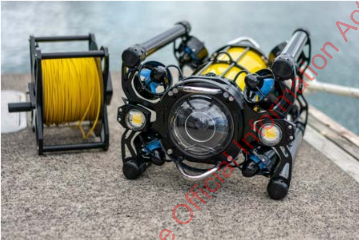
Figure 2. Boxfish ROV and tether reel.

The ROV survey will be aimed to provide video and still images that allow assessment of wreck integrity. A wreck integrity expert will be provided by Maritime New Zealand, who will provide report and assessment of wreck integrity. This wreck integrity expert will provide input during ROV survey planning and acquisition and may require ROV specifications that differ from NIWA's Boxfish ROV. Detailed costing for the ROV survey will be re-evaluated based on the prior seafloor survey results and consultation with the wreck integrity expert.