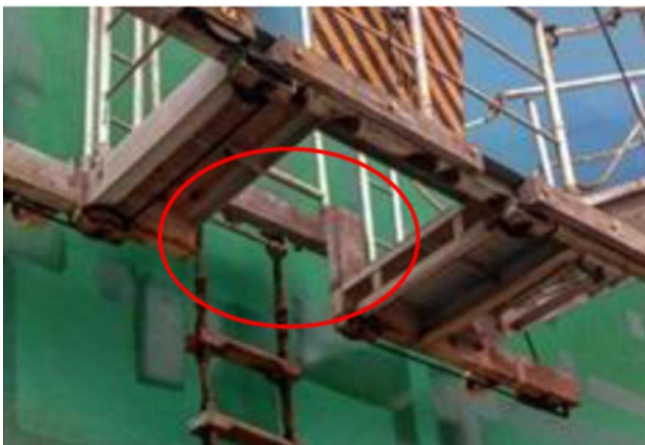
Figure 1: Pilot ladder/trapdoor showing the non-compliant horizontal cross-member.